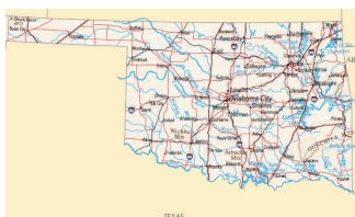
OKLAHOMA SPECIAL

Oklahoma will hold Special Primary and General elections to fill the U.S. Senate seat being vacated by Senator Tom Coburn. The Special Primary Election will be held on June 24, 2014, and the Special General Election will be held November 4, 2014. Under Oklahoma law, in the event that the top vote-getter does not receive over 50% of the votes cast in his/her party's Special Primary Election, the top two vote-getters of that party will participate in a Special Runoff Election held on August 26, 2014.