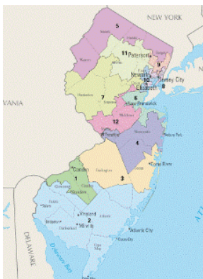
NEW JERSEY/01 SPECIAL

New Jersey will hold Special Primary and General elections to fill the 1st Congressional District House seat vacated by Congressman Robert Andrews. The Special Primary will be held on June 3, 2014, and the Special General will be held on November 4, 2014.