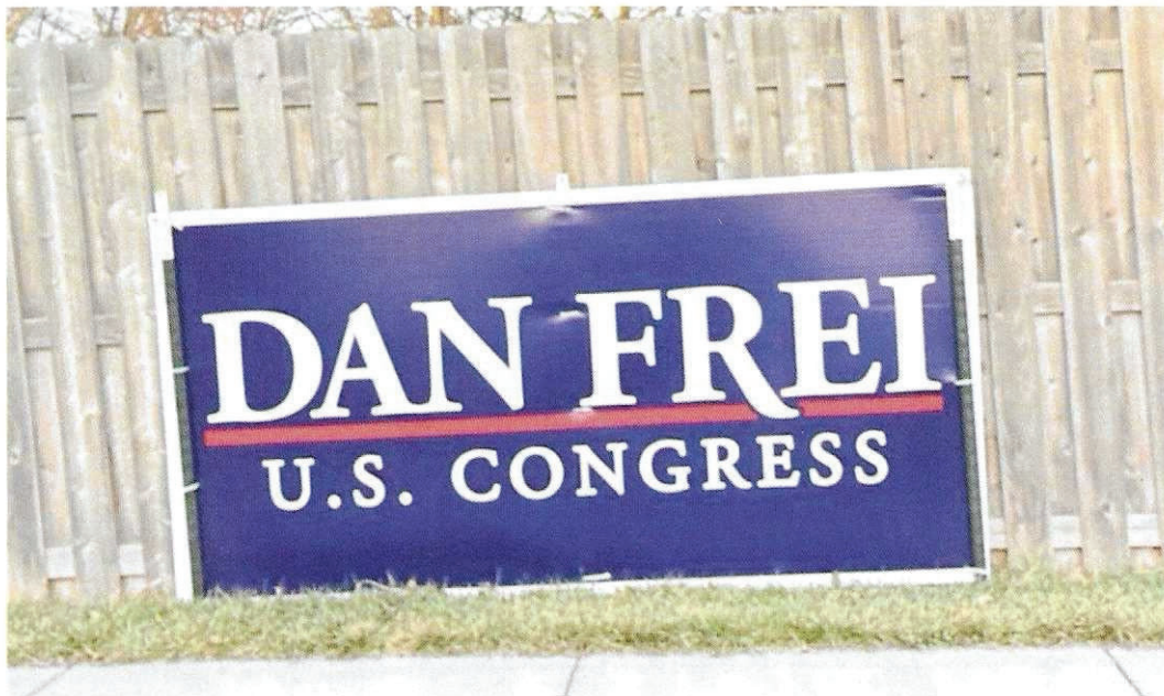
4' by 8' Dan Frei for Congress yard sign located near the intersection of South 114 th Street and Palamino Road in Omaha, Nebraska.