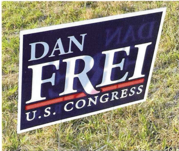
18" by 24" Dan Frei for Congress yard sign located near the intersection of North 96 th Street and West Dodge Road in Omaha, Nebraska.