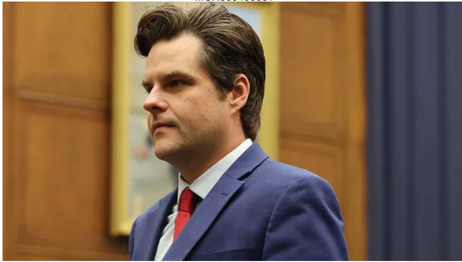
Rep. Matt Gaetz.