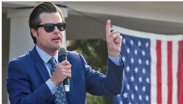
Congressman Matt Gaetz speaks during an outdoor town hall style meeting at the Niceville-Valparaiso Chamber of Commerce Building in Niceville. Gaetz Town Hall

Gaetz was often seen trying to pick up young women at 101 Restaurant in Tallahassee, where students from nearby Florida State University would frequent, ABC News reported.