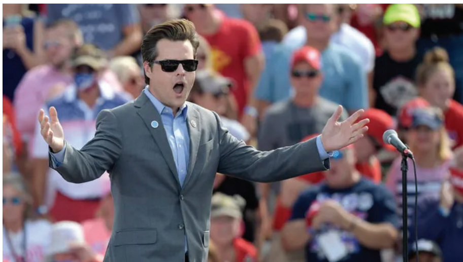
Rep. Matt Gaetz, R-Fla.