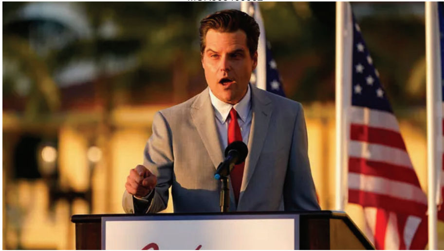
Rep. Matt Gaetz, R-Fla.

Gaetz has denied all wrongdoing in the case, saying that he has never paid for sex or had sexual relations with an underage female. An attorney for Gaetz told CBS News last week that "we have seen no credible basis for a charge against Congressman Gaetz. We remain steadfast in our commitment to challenge any allegations with the facts and law."