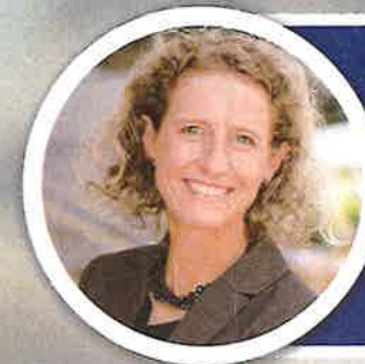
Jen Kiggans Criticized by pro-life leaders