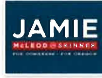
JMS Blue Yard Sign $25.00