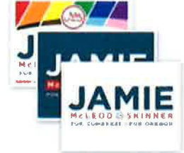
JMS Yard Sign Pack $55.00