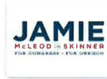
JMS White Yard Sign $25.00