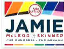
JMS Pride Yard Sign $25.00