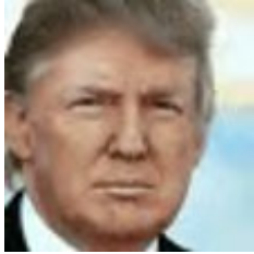
Donald J. Trump President of the United States