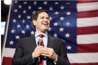
Senator Marco Rubio (R-FL)