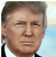
Donald J. Trump President of the United States