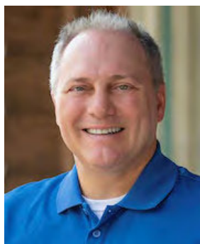
Steve Scalise House Republican Whip