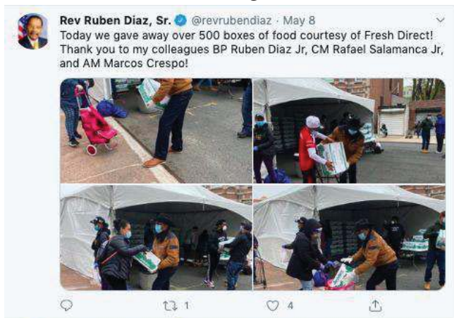
[This event at 800 E. 156 Street, Bronx NY is located in Rafael Salamanca's 17th Council District. ]

a. The following events are outside of the Council District with elected officials who are not running for office in 2020.