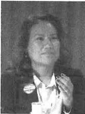
VERONICA ESCOBAR