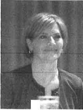
DORI FENENBOCK

More: House Democratic Whip talks DACA, endorsement of Escobar (/story/news/politics/2018/01/25/house-democratic-whip-talks-dreamers-endorsement-veronica-escobar/1065917001/)