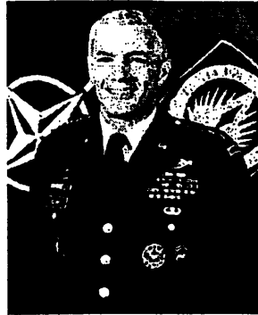
Wesley K. Clark General, U.S. Army, Retired