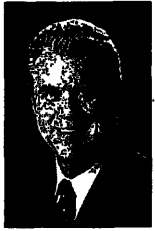
Governor Tommy Moore Supports the Port