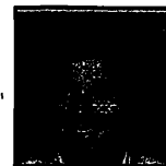
Probate Judge Joey Malphrus