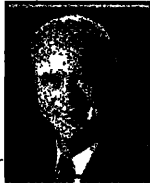
Governor Tommy Moore Supports the Port