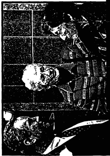
Congressman Van Hollen meets with constituents about issues before Congress.

Reaching Out to Constituents . . . Meeting Your Needs