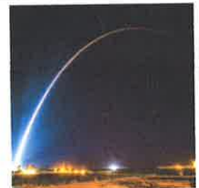
Trump calls for military to create space force Jun 18, 2018