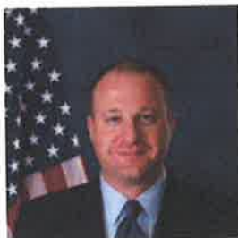
Polis and Stapleton lead in governor's race in early polling in El Paso County Jun 26, 2018