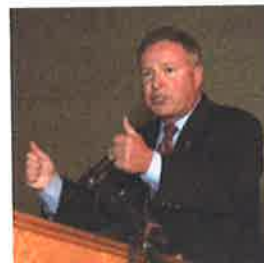
The best of the worst campaign ads: 2018 primary edition Jun 20, 2018