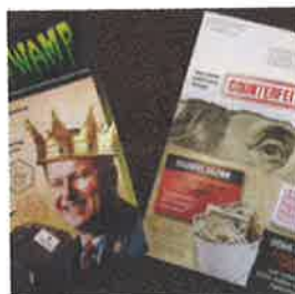
CD5 race turns ugly with "dumb and dumber" flier Jun 15, 2018