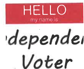
Unaffiliated voter numbers surge leading up to primaries Jun 8, 2018